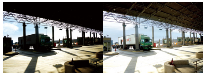
Without WDR Pro